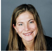
At Large Chair

The Board consists of seven volunteers, selected as listed in the captions below. At large members are chosen by the Board. To serve on the Board, you must be a registered voter in Tallahassee and preferably have some knowledge of government ethics. Board members are required to file annual financial disclosure documents with the Supervisor of Elections.