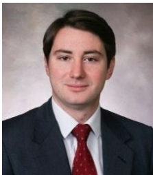
Public Defender Office