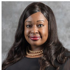
Florida A&M University